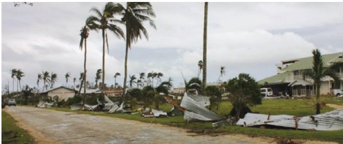
Corrugated iron litters the streets of Lifuka Island, Tonga

On February 12, 2018, Tropical Cyclone Gita passed over Tonga, causing significant damages and affecting 80% of Tonga's population. This triggered an insurance payout of US$3.5m, which was made within ten days of the event. Similar to the first payout, the second payout was also used by the government to assist with disaster response activities.