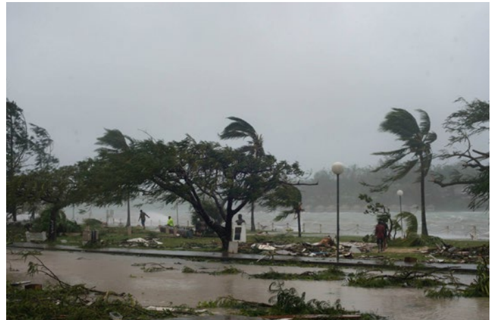
Devastation after Cyclone Pam.

On March 13, 2015 Tropical Cyclone Pam struck Vanuatu, triggering its parametric insurance policy for cyclone hazards. PCRAFI made a rapid disbursement of US$1.9 million to the government within 7 days of the event, which provided a rapid cash injection to minimize the fiscal shock from the event. The PCRAFI payout, intended to help support emergency response services, enabled Vanuatu to respond quickly to affected populations, including the mobilization of nurses to provinces impacted by the storm.